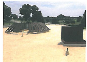
14321 Nicollet Court Burnsville, MN

Rayco Construction installed tan GAF TPO on the roof at 14321 Nicollet Court in Burnsville, MN. Like us on Facebook and view more images of the work at the site.