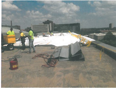
The crew working hard to finish the roof at the Augsburg College Library.

These questions can be tough to answer and give an exact date. When it comes to completing a re-roof job, there are factors that play a role in starting and finishing the job on time. A big hurdle can be obtaining a permit. A permit is needed to start most jobs and each city requires different material in order to issue a permit. Some cities expedite the process while others can take weeks. An inspection is also needed from the city and the manufacturer, once the roof is completed. This information was published in a previous newsletter, but the weather also plays a role in the length of time it takes to complete a job. We closely watch the weather to make sure we can work and keep building owners up-to-date on our progress.